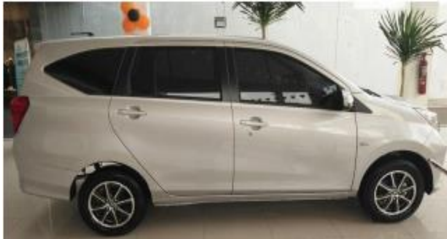
Figure 7. Research Object