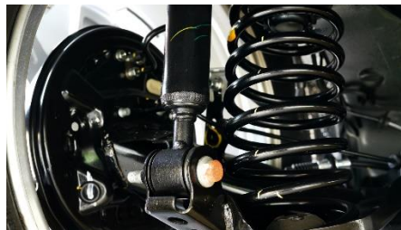
Figure 3. Shock absorber

Shock absorber is an important component of a vehicle's suspension system, serves to reduce the oscillating force of the spring. Shock absorbers slow down and reduce the magnitude of the vibration of the movement, by converting the kinetic energy of the suspension movement into heat energy that can be dissipated through the hydraulic fluid (Majanasastra 2013) .