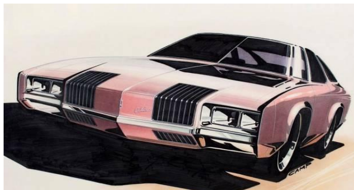
Figure 1. Car

Cars that have more passenger capacity are the choice of almost the majority of Indonesian people, the majority of whom have a large number of families, including in the city of Pekanbaru. The car, which is a low-cost car, is a family car with a capacity of 7-8 passengers, becoming an option for consumers. So that a car that is included as an affordable type that also has a large capacity is the toughest choice for the Indonesian people (Wulandari 2013)