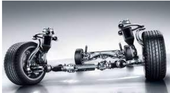
Figure 2. Suspension

Suspension can be defined as a preparation containing finely divided drug particles distributed evenly in a vehicle where the drug shows a very minimum solubility (Wahyuni, Yunalti, and Syofyan. 2017) , Suspension is a dosage form containing solid drug ingredients in fine and insoluble, dispersed in a liquid carrier and is a heterogeneous system consisting of two phases (Chasanah, Trisharyanti DK, and Indrayudha 2012)