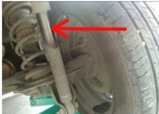
Figure 5. Toyota Calya Rear Absorber Seal Leak.

This research was conducted in the Jatiwaringin Super Shop & Drive workshop area by observing the condition of the Toyota Calya shock absorber when there were customers who did service to the workshop, then the author conducted several analyzes of what caused damage to the Toyota Calya shock absorber. The author then carried out load tests and measurements of several factors that were considered the cause of the Toyota Calya shock absorber damage. The test results will be recorded data .